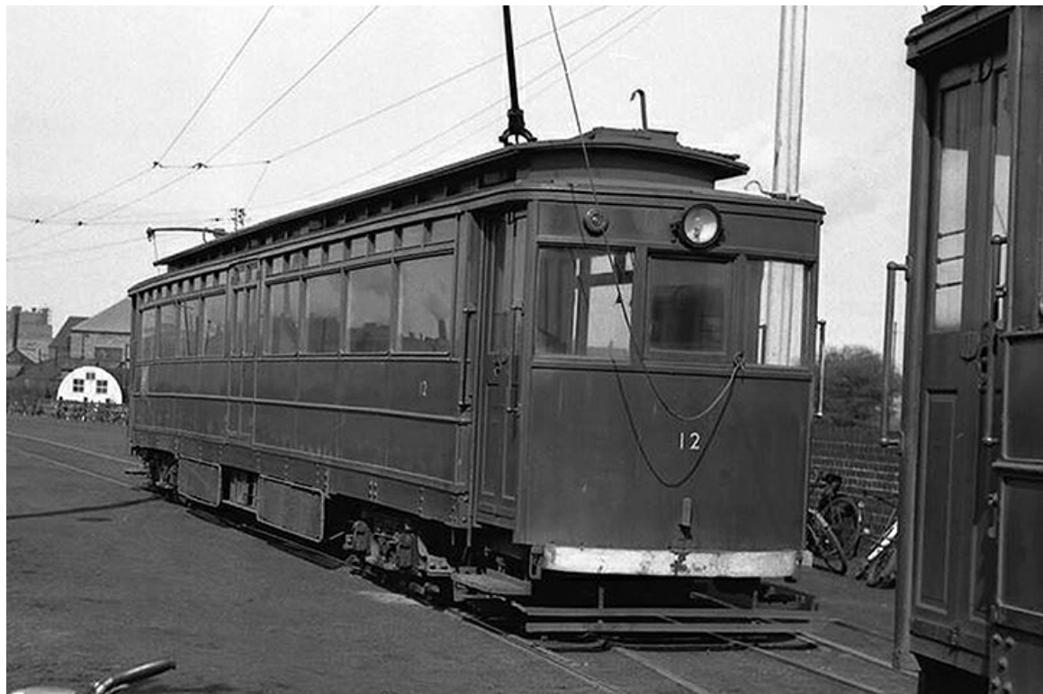
Grimsby & Immingham No. 12 new in 1913 seen at the Grimsby terminus at Cleveland Bridge in 1958. (John Kaye).