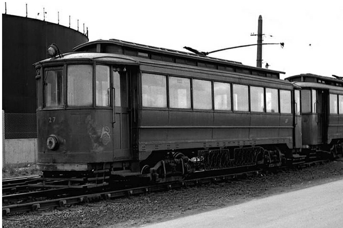
Grimsby & Immingham No. 27 was ex-Gateshead No. 16 and was one of fourteen from the 1-20 batch acquired in 1951. It was a 48-seat car built by Gateshead on Brill 39E Maximum Traction trucks and was scrapped in 1961. (John Kaye).