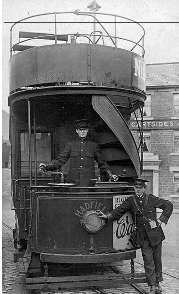
1903 Milnes 4-wheel open top double-deck car No. 1 at the Queens Arms in Old Glossop. (LTHL collection).